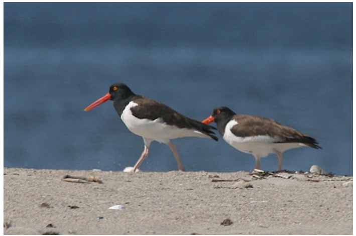
American Oystercatchers ( Haematopus palliatus).