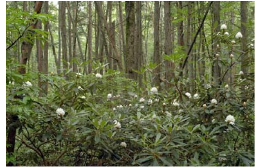
Rhododendron maximum in white cedar swamp.

In our last issue of "Avalonia Trails" we reported that Avalonia had been successful in obtaining a grant towards the purchase of the Bell Cedar Swamp in North Stonington through the State of Connecticut's Open Space and Watershed Land Acquisition Grant Program. This was a huge achievement, since competition for these grants is fierce. However, the grant will cover only 50% of the estimated purchase price of the land, so efforts are now underway to raise the remaining 50% of the purchase price plus necessary funds to cover ancillary expenses (legal fees, title searches, survey). As shown graphically in the chart, thus far we have raised $25,000 from a total of four successful grant applications. Donations by private individuals have contributed an additional $7,560, while $6,800 has been pledged., leaving us with a remaining shortfall of $25,140. We hope to close this gap with additional