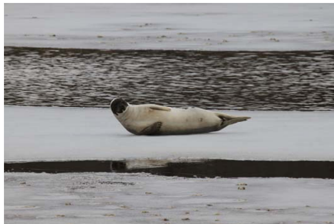
Harp seal relaxing on the ice .

This harp seal appeared healthy, without distress, and it stayed until Sunday morning and then as quickly as it came, was gone. This unusual visit by this marine mammal just emphasizes how special this tidal estuary ecosystem is and can be for people and for wildlife. Easy sightings such as this make people curious about wildlife and where they live which makes education about and appreciation of our natural resources such as Poquetanuck Cove that much easier. And if you have yet to discover Poquetanuck Cove, please consider joining us on the water on June 4: see page 6 for details.