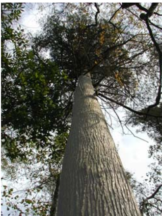
A magnificent example of Atlantic White Cedar in Bell Cedar Swamp.

If you would like to hear more about Bell Cedar Swamp, plan to attend our Annual Meeting which will feature a presentation by Duncan Schweitzer. See page 3 for details.