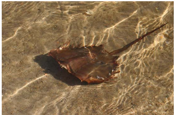
Horseshoe crab ( Limulus polyphemus ).

Horseshoe crabs will also be coming back; and thanks to the hard work of the "taggers" more and more information is being discovered about these ancient creatures' migrating habits.