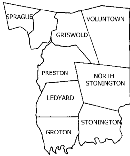
Map of New London county, showing existing membership of Avalonia, plus Sprague.